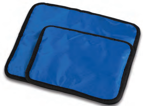
Nylon fabric warming pad available in 2 sizes