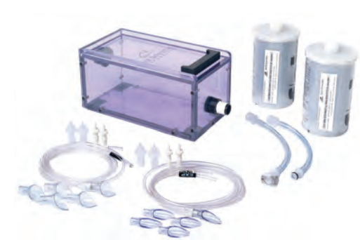
Starter Kit includes all the accessories needed to begin your procedure.